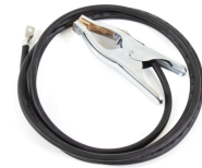
Earth return cable 25 mm 2 , 5 m