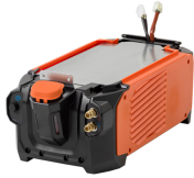
Master Cooler 05M

Cooling unit for easy, fast, and convenient coolant filling with integrated LED lighting for cooling liquid levels.