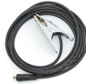
Earth return cable 5 m, 16 mm 2