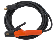
Welding cable 5 m 25 mm 2