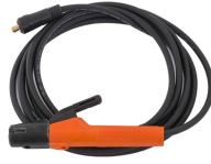
Welding cable 5 m 16 mm 2

The Flexlite TX torches are designed for use with Kempfi's TIG welding machines. The torch range includes several neck models, offering superb cooling performance and good access to challenging joint designs.