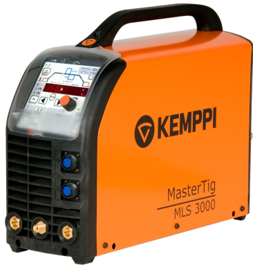
MasterTig MLS 3000

MasterTig MLS 3000 sets the standard for industrial TIG welding. Precise and refined welding quality for workshop or site use, MasterTig MLS 3000 has become an industry standard, offering the necessary performance in a lightweight and portable design. This welder is a 300 A version.