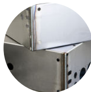
THIN SHEET FABRICATION